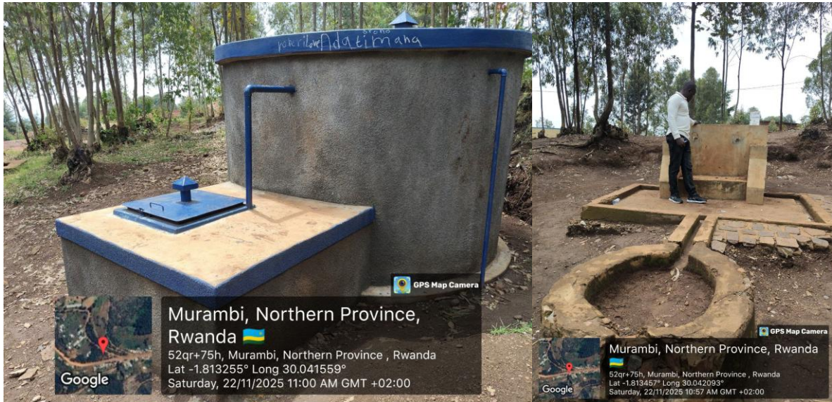
Photo 3: Water infrastructures are not working near the local business centre leading communities to take long distance to find potable water-60min