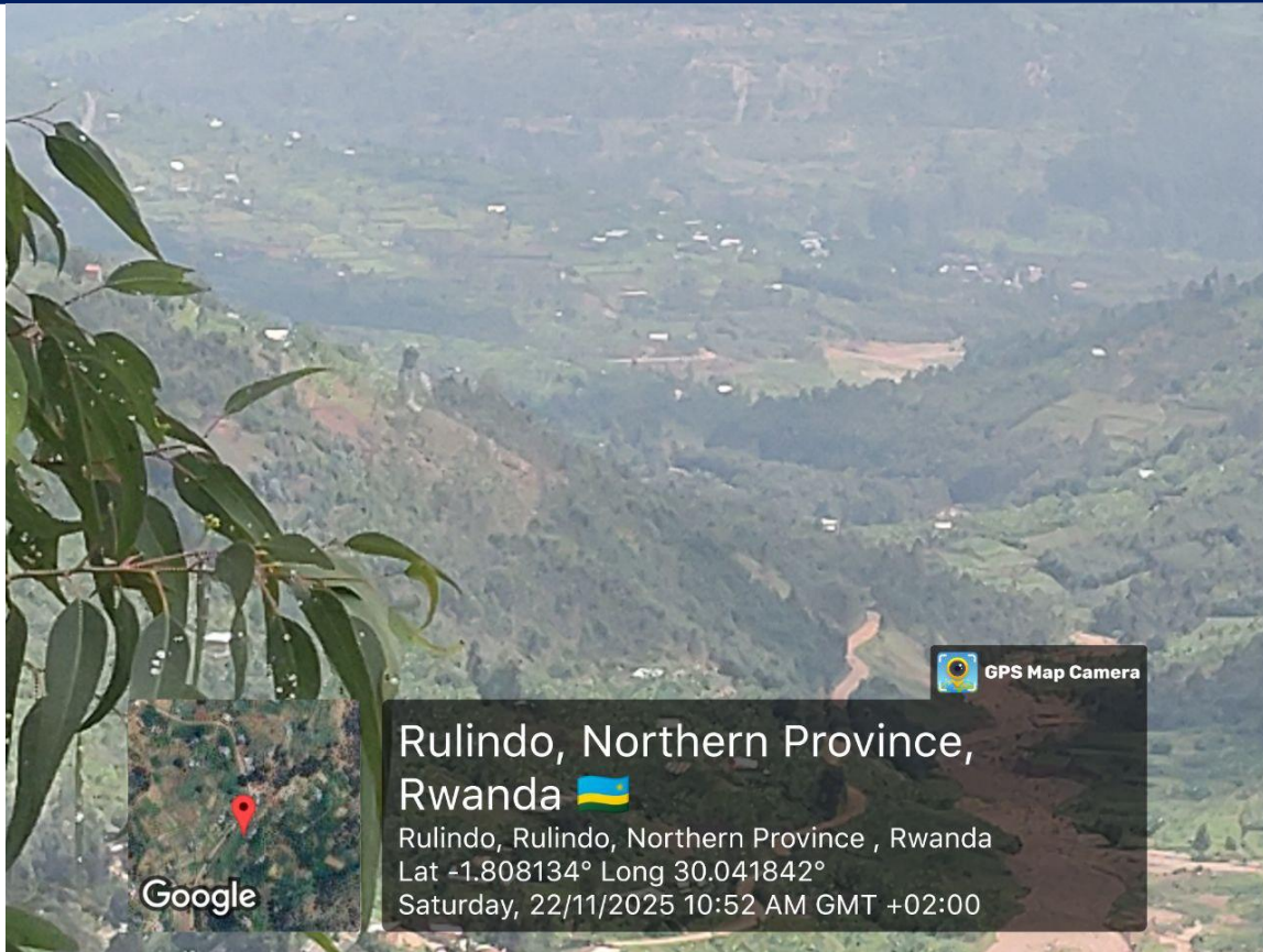
Photo 5: Large communities live in the near Rutongo mining sites wishes social interventions there like formal ECDs, cemetery and others.

Kanyinya, Nyarugenge, Umujyi wa Kigali, RWANDA