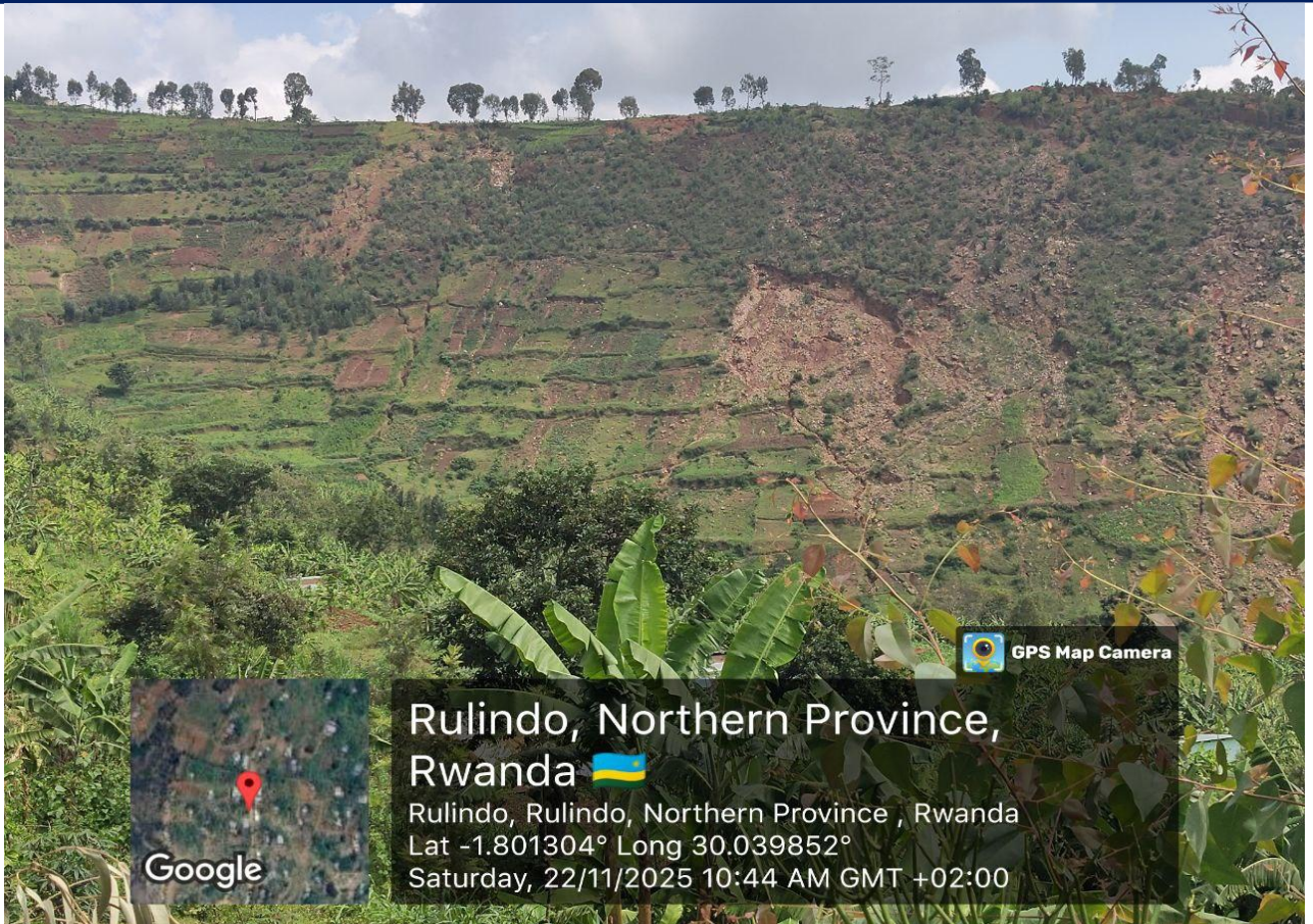
Photo 4: Left mining sites, gullies and illegal mining actions need environmental interventions

Kanyinya, Nyarugenge, Umujyi wa Kigali, RWANDA