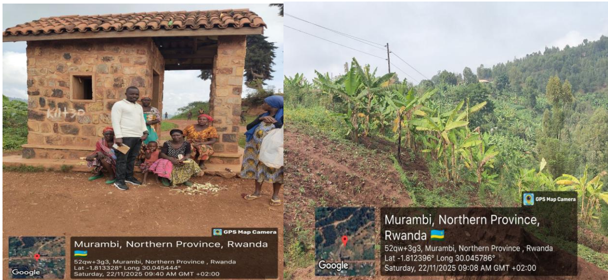
Photo 2: Communities discussions on possible interventions to restored watershed near the Trinity mining Rutongo concession sites.