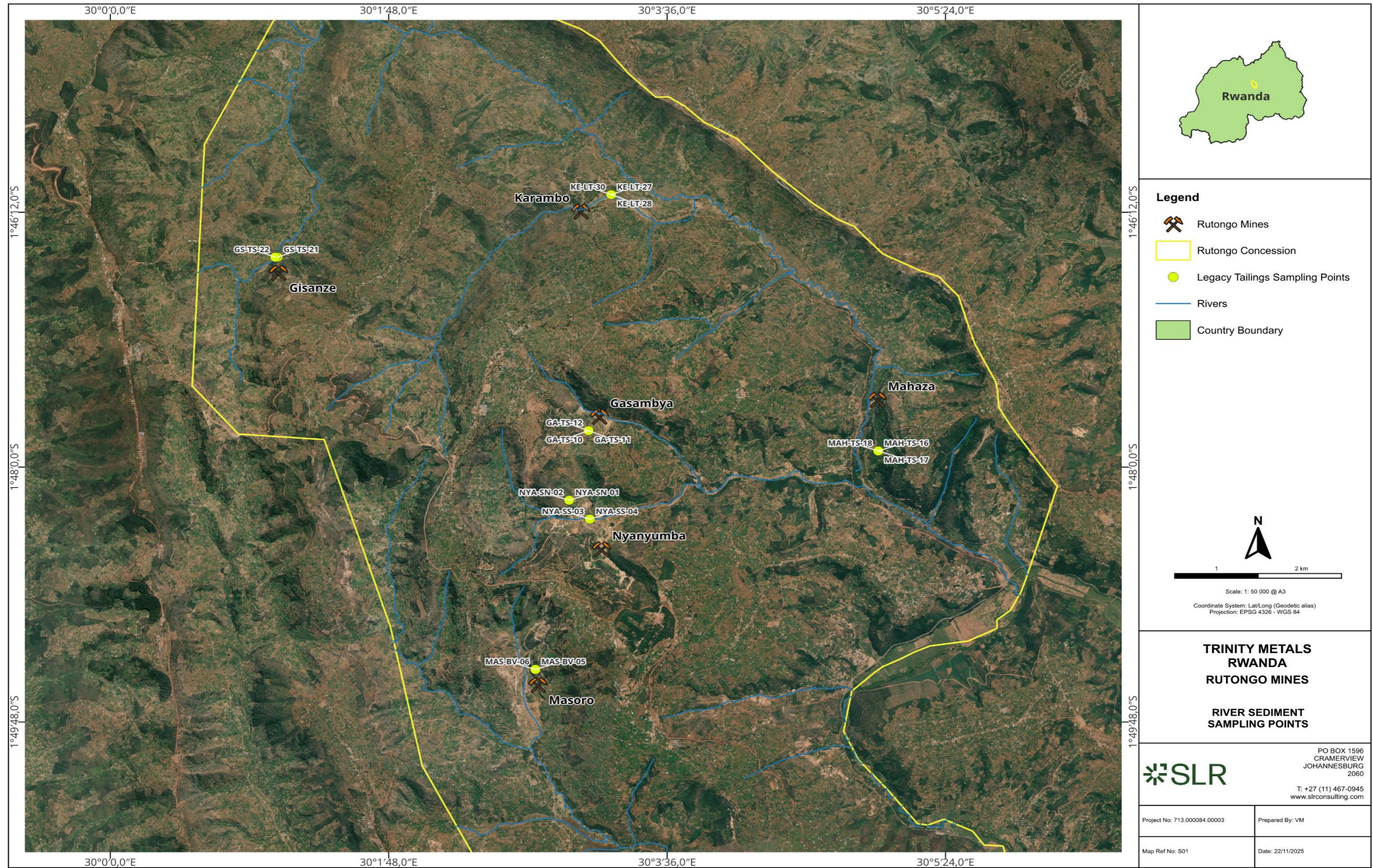
Figure 3-1: Rutongo Mines Legacy Tailings Sampling Points