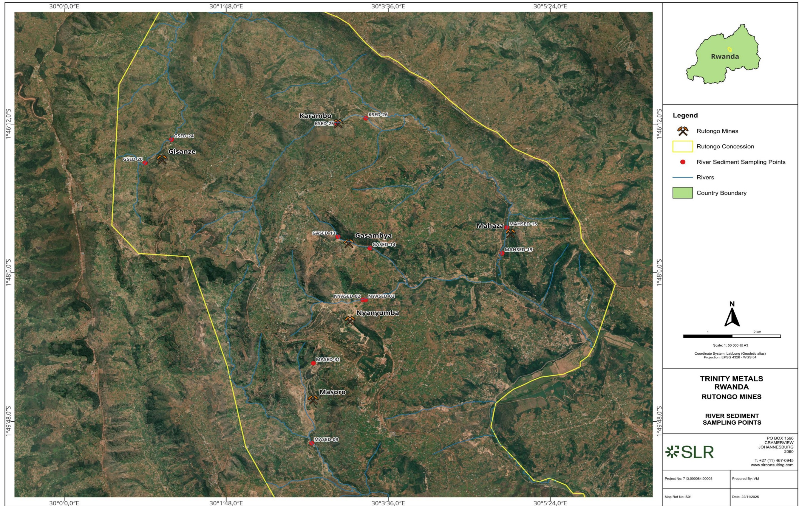
Figure 3-2: Rutongo Mines River Sediment Sampling Points