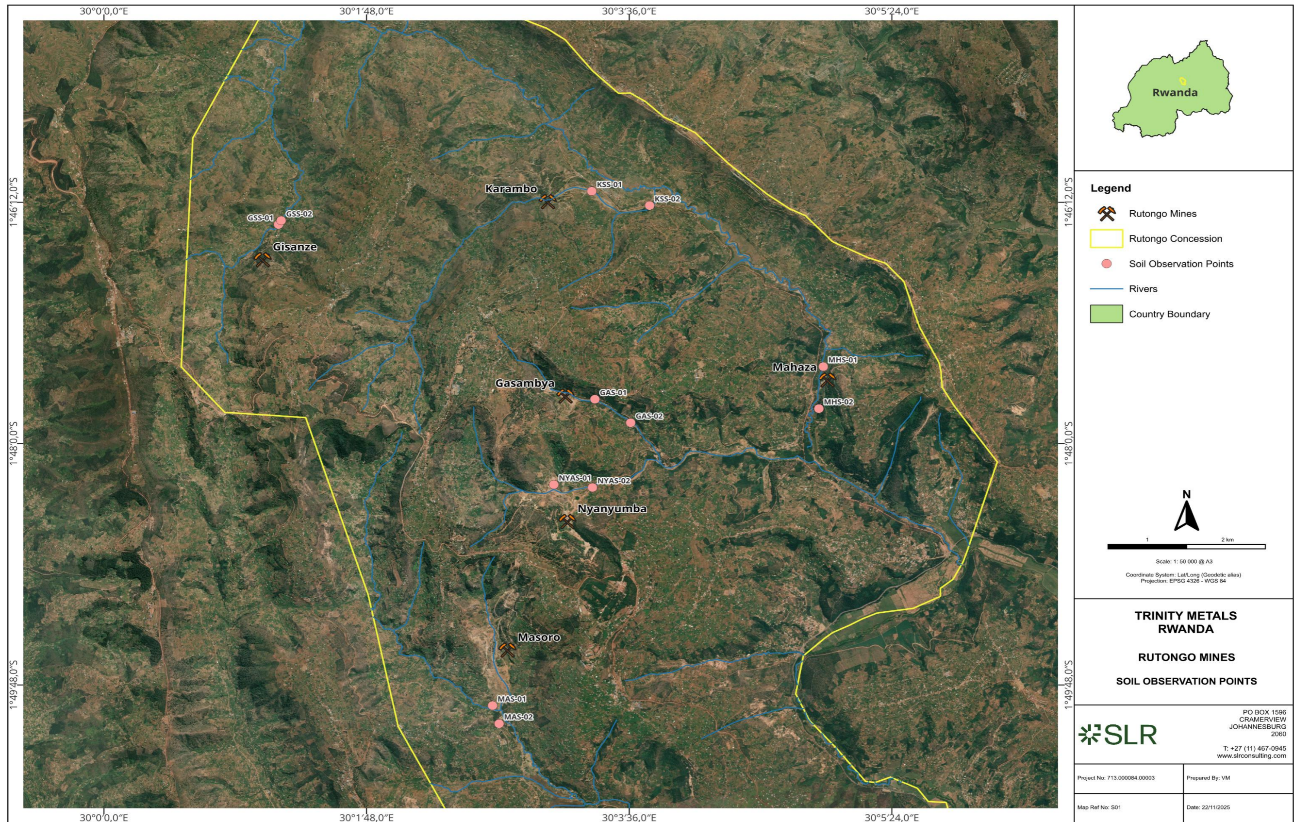
Figure 3-3: Rutongo Mines Soil Observation Points