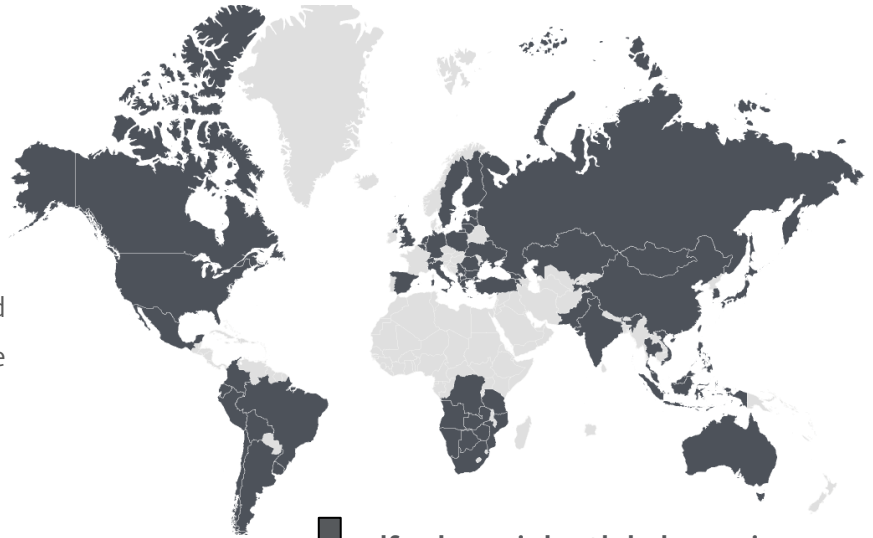
Alfred H Knight Global Locations