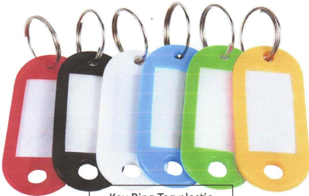
Key Ring Tag plastic