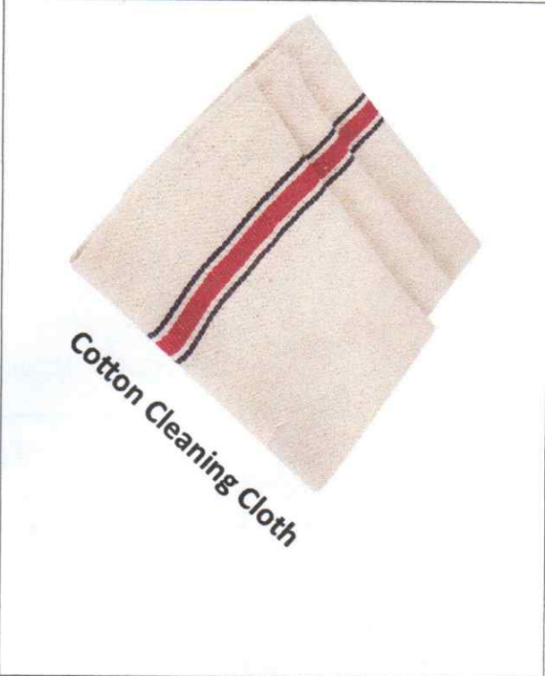
Cotton Cleaning Cloth