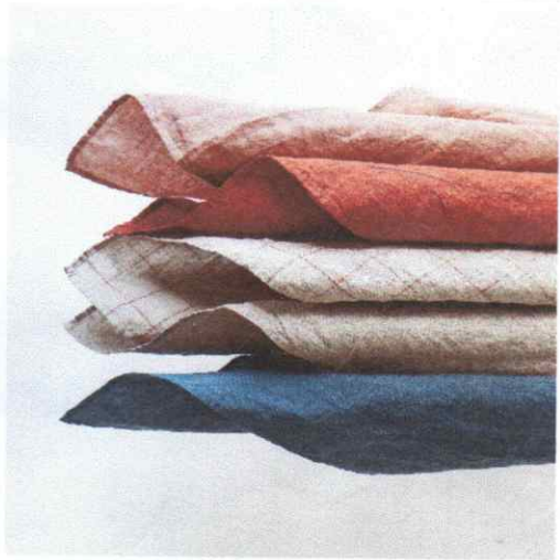
Cotton Dish Towel